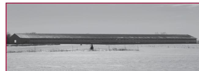
An outside shot of our newly expanded feeding barn... 1/8 of a mile in length!